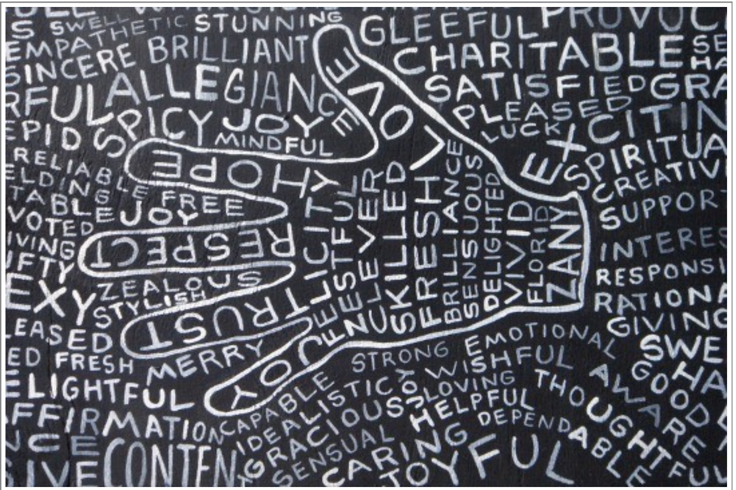
"Living Word" Painted on the back of a wine crate and photographed by Denise Cardonell (Used with permission) https://tinyurl.com/CBA101021